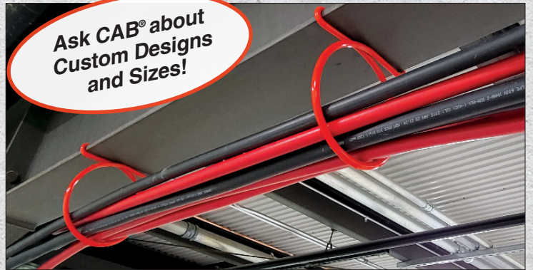
CAB® hooks are designed for many different uses. CAB® T-Bar Hooks have a wide, bottom carrier loop to securely capture large, heavy bundles.

Ask CAB® about Custom Designs and Sizes!