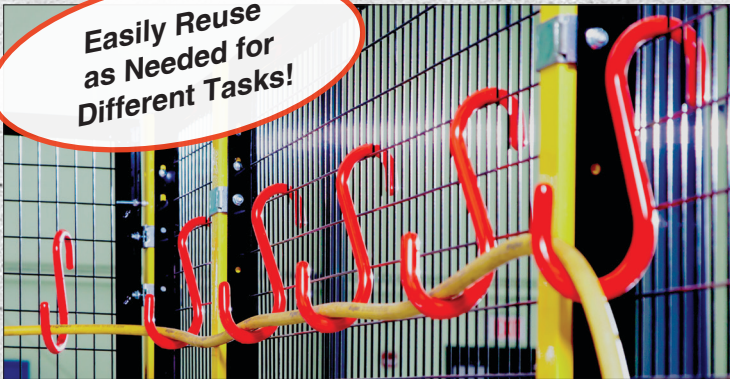
Strong, versatile CAB® S-Hooks easily install to nearly any support. Bottom loop is wide enough to securely capture large bundles.

Easily Reuse as Needed for Different Tasks!