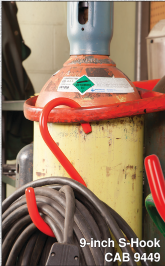
9-inch S-Hook CAB 9449