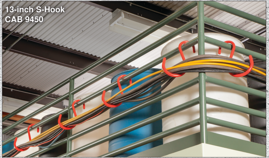
13-inch S-Hook CAB 9450